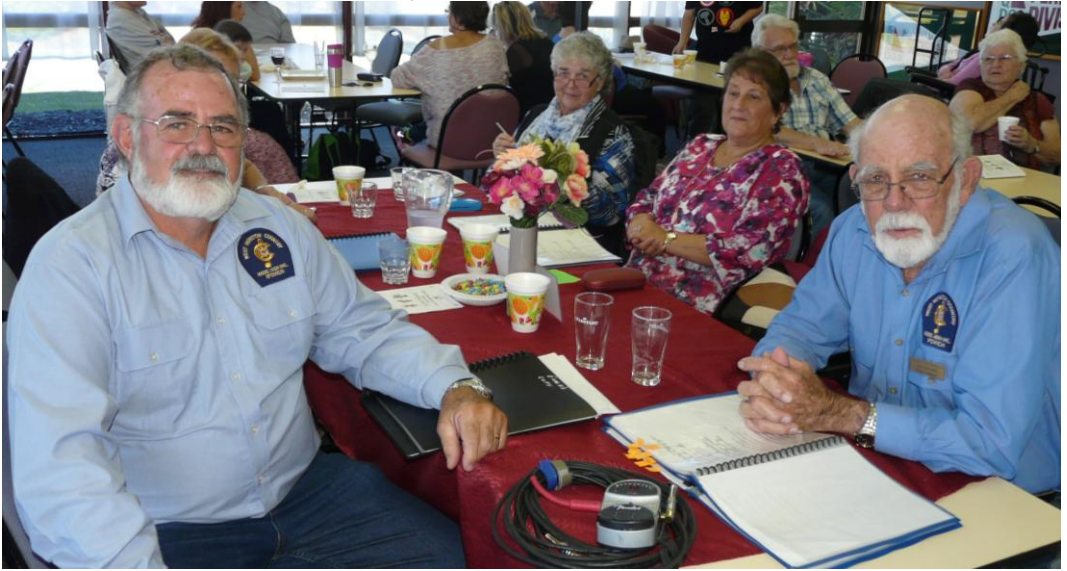
West Moreton CMC