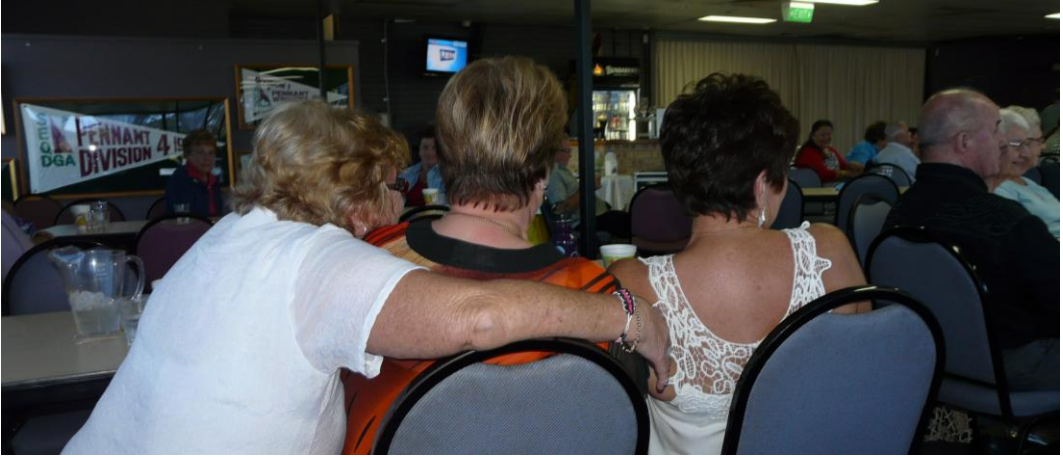
Two Presidents sharing the love