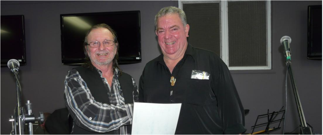
Guanaba CMC members